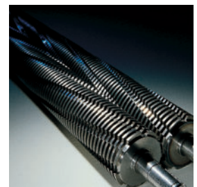
unaffected by staples and metal clips