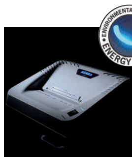
management system with illuminated indicators for power saving in stand-by mode