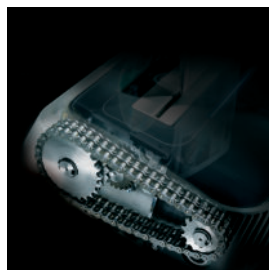
heavy duty chain drive system and metal gears