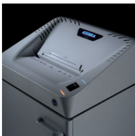
Easy to operate ON Off Reverse switch, with LED signal for bag full or open door